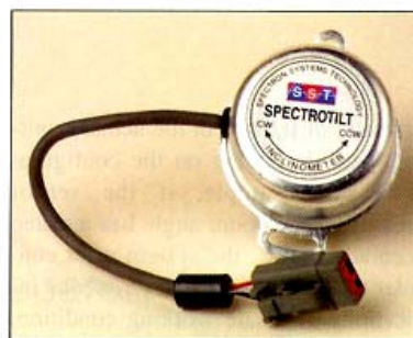
Spectron Systems Technology's Spectrotilt™ electronic inclinometer.

was determined that a digital compensation routine would have to be used for numerous reasons. Foremost, the base linearity of the sensing element could not be improved further without adding significant cost. In addition, the random nature of the temperature coefficients, in terms of polarity and magnitude, ruled out traditional compensation techniques and blanket corrections. This